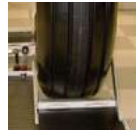
Lg Wheel 0" & 0"