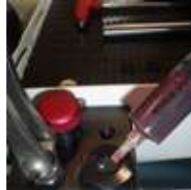
Top off Reservoir

Contact Alberth Aviation if you have any questions regarding the operation or maintenance of this Hydraulic Wheel Dolly at 800-821-9811. The online demonstration video may also be helpful.