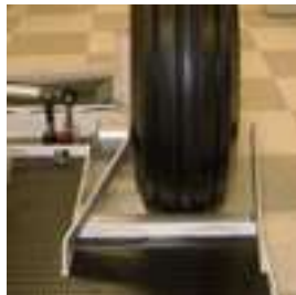
Small Wheel 0" & 4"