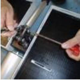
Hinge bolt removal