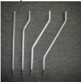
Wheel Guides 0,1,3,4"