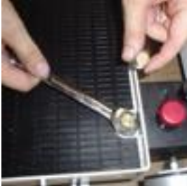
Replacing ship plug

The Hydraulic Wheel Dolly is shipped with a brass-shipping plug to prevent fluid leakage during shipping.