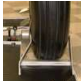
Med Wheel 0" & 3"