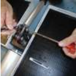
Hinge bolt removal