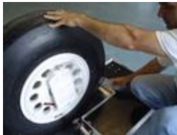
Wheel guides & loading

Stabilize the wheel with one hand to prevent the wheel from falling after release from the Hydraulic Wheel Dolly.