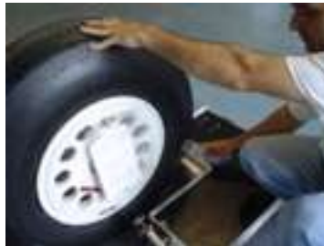
Wheel guides & loading

Turn the bleeder valve knob counterclockwise \frac{1}{2} to 3 turns to open the valve. DO NOT over rotate the valve. The more the valve is opened, the faster and easier the dolly will extend.