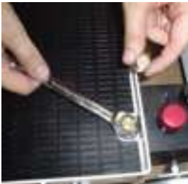
Replacing ship plug

The brass-shipping plug must be replaced with the included stainless breather plug using a proper wrench.