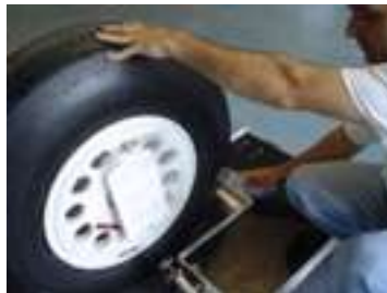
Wheel guides & loading

Pump the pump handle and lift the wheel with the Wheel Dolly rollers. The wheel should be lifted to approximate the height of the axle that has been previously jacked.