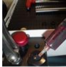
Top off Reservoir

Contact Alberth Aviation if you have any questions regarding the operation or maintenance of this Hydraulic Wheel Dolly at 800-821-9811. The online demonstration video may also be helpful.